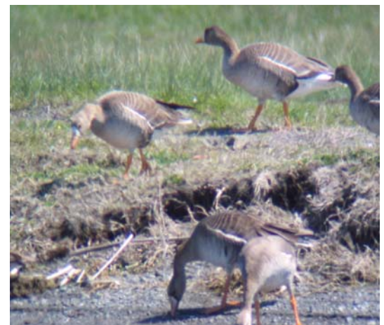
Greater White-fronted Geese

Waterfowl - Greater White-fronted Geese made their fall appearance at Jamestown on Sept 26. A flock of eight Snow Geese were found on the eve of Sept 23 at the Creamery on Towne road and continued to be seen trading back and forth across the face of Dungeness from the Rec Area to Jamestown from Sept 23 to Oct 4 with flock size from six to 10 birds. It was at this time that a Ross's Goose made it's appearance over Dungeness on Sept 28; however the caveats are several: rarity, time of migration, and flock association. This would be the first record for Clallam County. On Oct 18, Tonia Signor reported the first Brant in the county seen at Lincoln Park in P.A. Cackling Geese have made a substantial appearance on the peninsula this fall with flocks scattered everywhere; the population during October has been estimated to be over a 1,000+ birds. The first fall Trumpeter Swans made their appearance on Oct 25, as three flew in over Dungeness, heading to Les Jones' marsh. A very unusual sighting of a Tundra Swan in the Freshwater Bay area was made by Paulette Ache on Oct 28; she reported that the yellow teardrop at the base of the bill was distinct. American Wigeon seemed to make their fall appearance overnight. On Sept 14 there were only a few on Dungeness Bay; yet on the eve of Sept 15 Scott Gremel watched at least a thousand birds fly into the Bay. (Continued on next page)