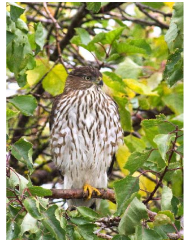
Juvenile Sharp-shinned Hawk