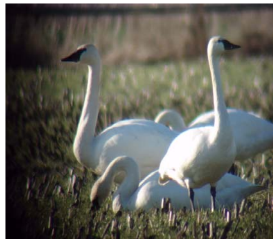
Trumpeter Swans

The observations by swan surveyors will provide a data base of information that counts swan numbers and locates feeding areas and night roosts. By immediately reporting an injured, sick, or dead swan, Washington Department Fish and Wildlife (WDFW) can collect and remove the swan to determine the (Continued on next page)