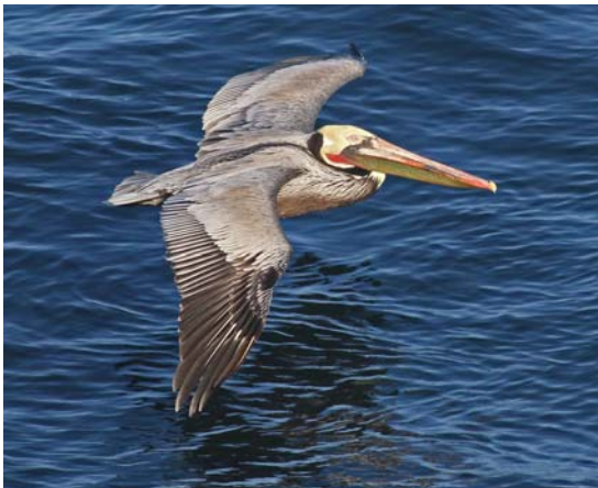
Brown Pelican