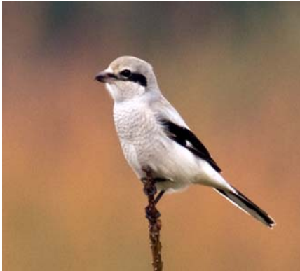
Northern shrike

of Helen's Pond [Oct 7]. Several warblers put in a good appearance as fall began in earnest. A MacGillivray's Warbler was found foraging through blackberry brambles along Seashore road. Nine Townsend's Warblers in two flocks, were tallied along the Birdwalk on Oct 10. Similarly, a half dozen were found in the lower walkway of the DRA several days later. On Oct 11 a Palm Warbler was found working the edge of brambles at the entrance to the Dungeness NWR Spit.