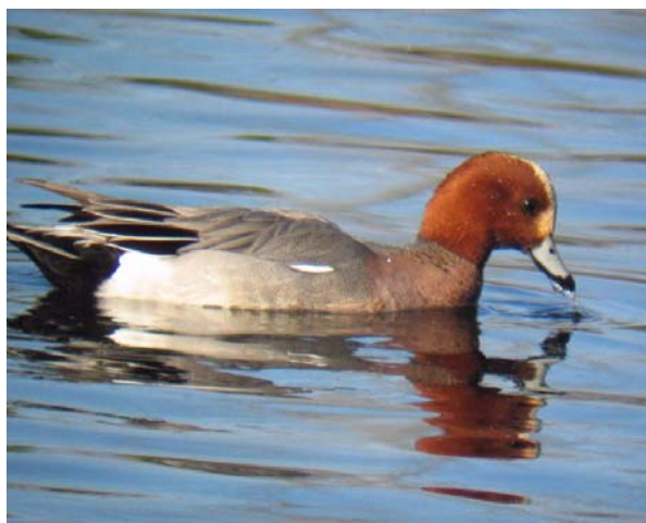
Eurasian Wigeon