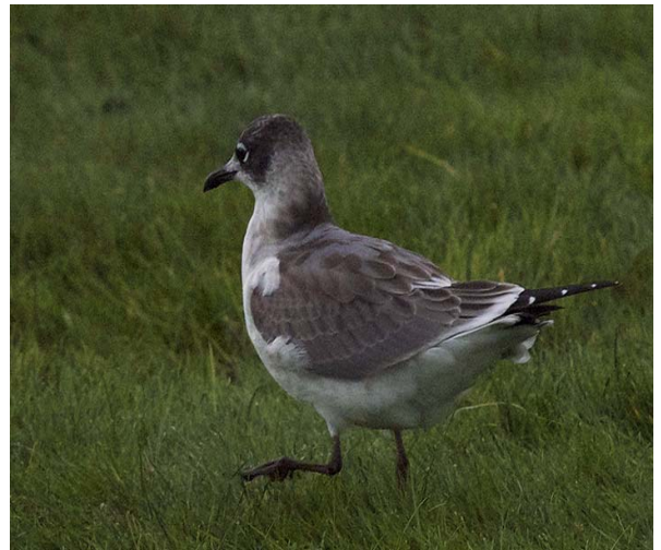
Franklin's Gull