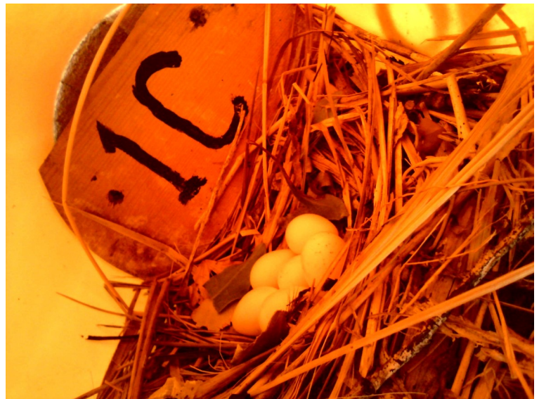
6 Purple Martin eggs in nest box, using Dow Lambert's endoscope.

reported that we have at least 3 Martins in the 4 boxes. Nesting activities on-going. We believe one of the birds is a 2nd year male, so we're optimistic we'll have chicks this year.