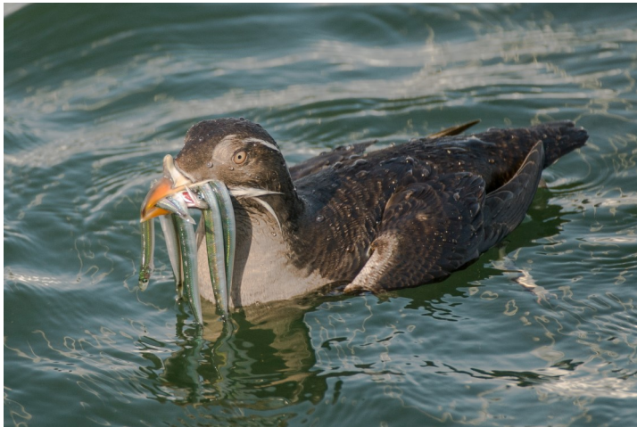
Rhinoceros Auklet with fish