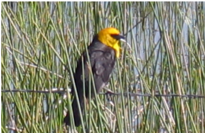
Yellow-headed Blackbird

Several species scored lower-than-average numbers. Other than offshore seabirds, species with low numbers included Red-throated Loon, Pacific Loon, Whimbrel, Olive-sided Flycatcher, Hammond's Flycatcher, Pacific-slope Flycatcher, Steller's Jay, Chestnut-backed Chickadee, House Wren, Golden-crowned Kinglet, Cedar Waxwing, Townsend's Warbler, MacGillivray's Warbler, Wilson's Warbler. There was a general trend for lower numbers of neotropical migrants such as flycatchers and warblers. Were they just late this spring, or are their numbers really lower this year?