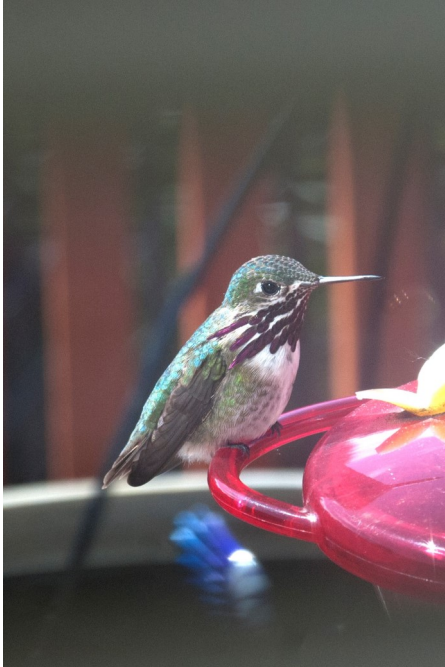
Calliope Hummingbird