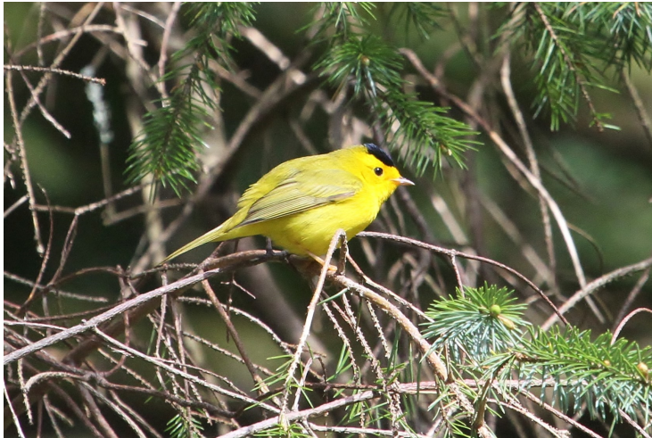
Wilson's Warbler