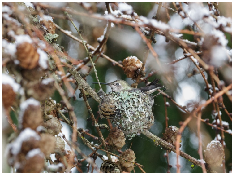
Anna's Hummingbird

to document the entire nest attempt, even during February snow storms. Anna's Hummers are renowned for winter nesting in California, but this is ridiculous! The bird laid its first egg on 2/16, the second egg on 2/18, the chicks hatched in early