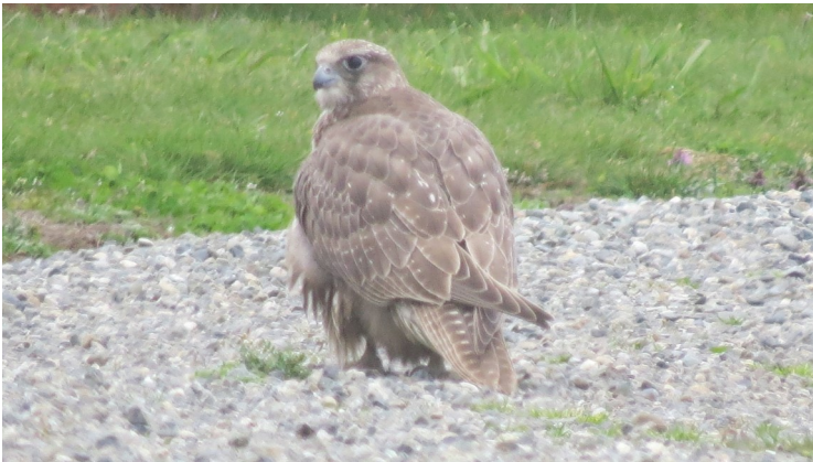
Gyrfalcon