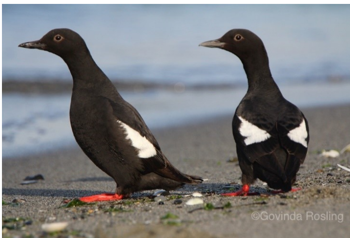
Pigeon Guillemots

If you like to watch seabirds along beaches, please consider becoming a volunteer this summer to monitor Pigeon Guillemots as an indicator species for nearshore health. It only requires one hour of your time (to be completed before 9 a.m.), one day per week, from June through August. This project was initiated last year, and was co-sponsored by OPAS and Clallam