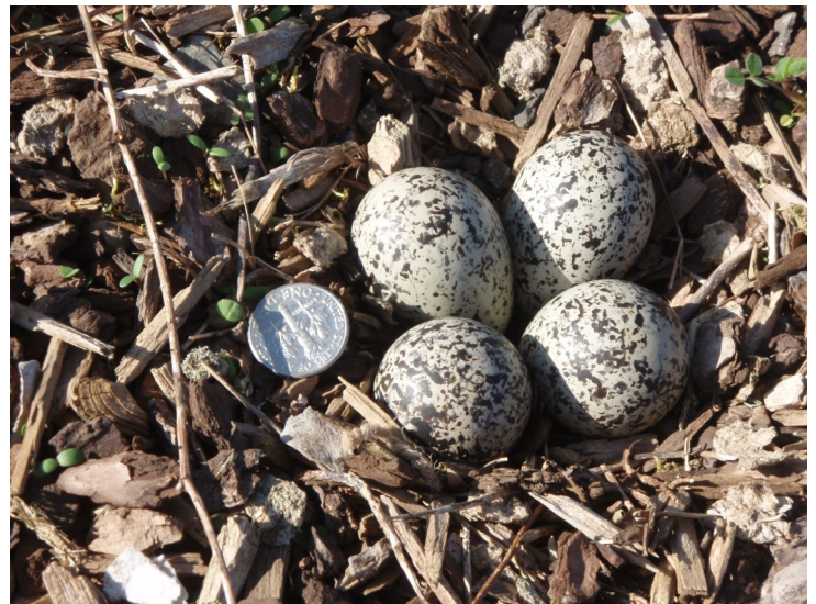
Killdeer Nest