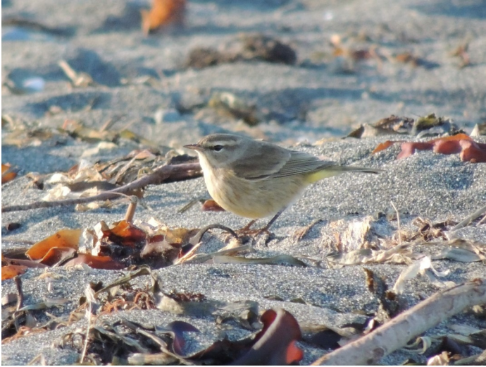
Palm Warbler