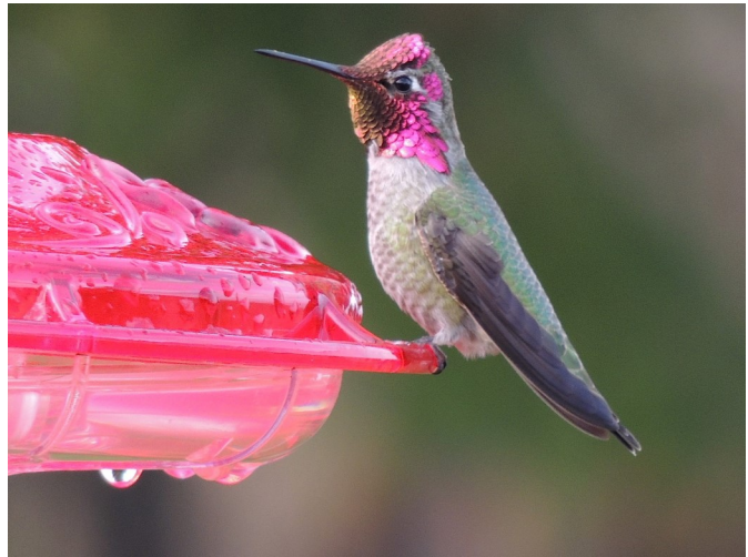
Anna's Hummingbird (Male)

their northward movements, even occasionally seen in British Columbia, so keep your eyes out for more.