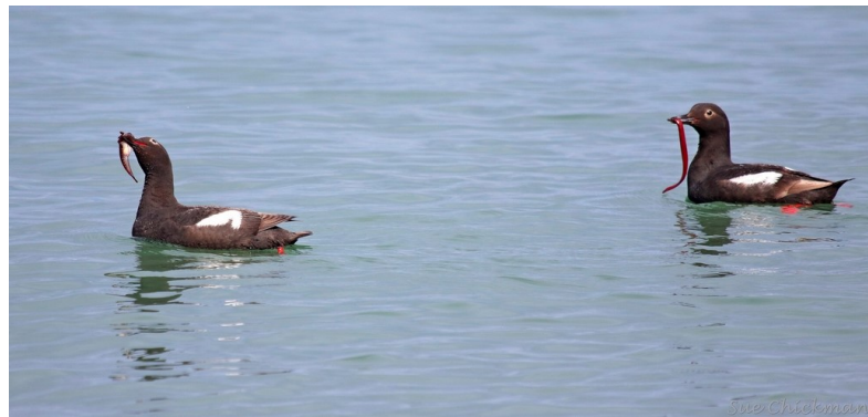
Pigeon Guillemots