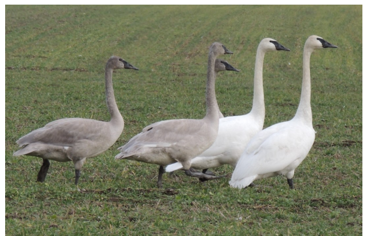
Trumpeter Swans