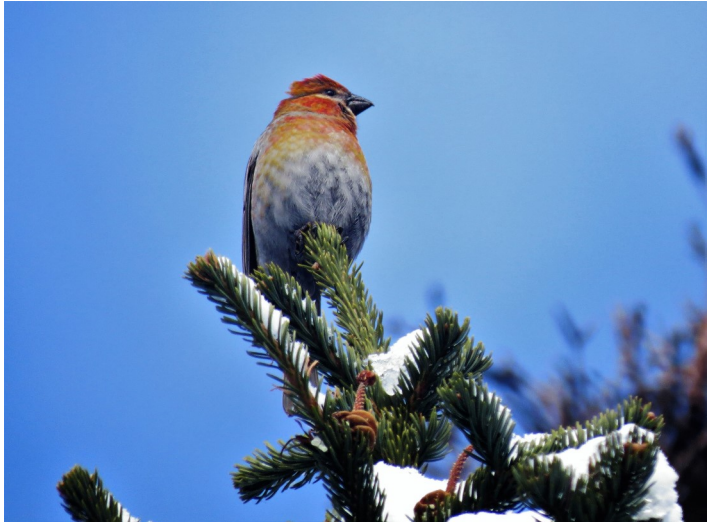
Pine Grosbeak