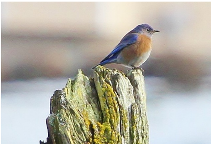
Western Bluebird

Ten separate Western Bluebird sightings were reported during the months of December, January, and February on the Miller Peninsula. One male on Thompson Rd; 3 adults, one male and 2 females on Catlake Rd; 1 male on Knapp Rd; 2 on Old schoolhouse Rd; and five, 2 males, one female, or immatures on Gardiner Beach Rd. Six bluebirds were also reported: two males, one female and two immature males on January 7 on Bagley Creek Rd, and two on Highway 101 near Discovery Bay.