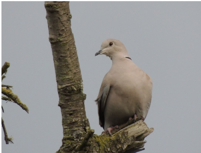
Eurasian Collared Dove

The next increasing species might be the California Scrub-Jay, a species created by the AOU last year when they split Western Scrub-Jay. Michael Hobbs, while driving on Old Olympic Highway near Cays Rd on 12/31/16, spotted a California Scrub-Jay beside the road. Gary Bullock found it again on 1/2/17, and it's probably still around. Other Scrub-Jay sightings have increased in the last couple years in eastern Clallam County. Scrub-Jays continue