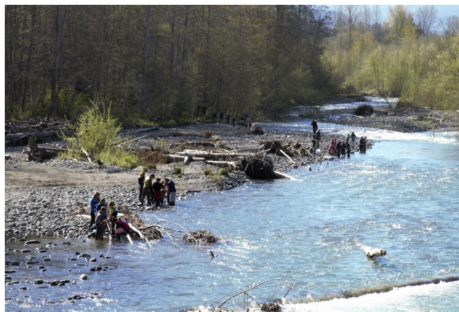
Exploring the Dungeness River Ecology

Cost: $50 for River Center Members/ $75, non members; pre-registration necessary