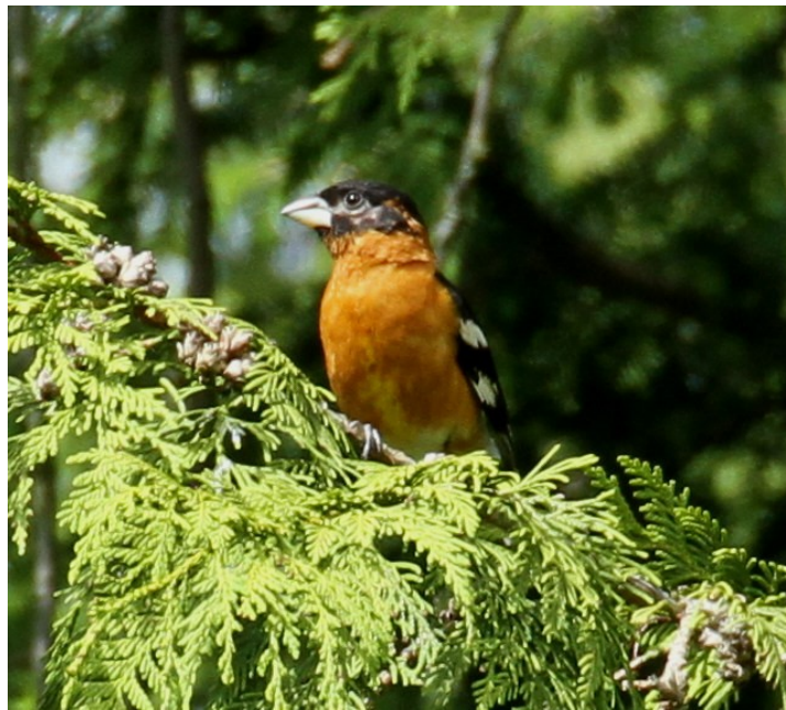
Black-headed Grosbeak

Passerine species that set records or near records this year included several we normally consider "late-spring migrants," such as Western Kingbird, Purple Martin, Swainson's Thrush, Yellow Warbler, Wilson's Warbler, and Black-headed Grosbeak. This year two things encouraged high counts for these species. First, it was an "early" spring, with warm weather coming early, both here and throughout their migration route, and second, our count, which almost always occurs on the second Saturday in May, occurred as late as possible, on May 14. So it was a late count date in an early-weather year, if that makes sense, which favors high counts of late migrants.