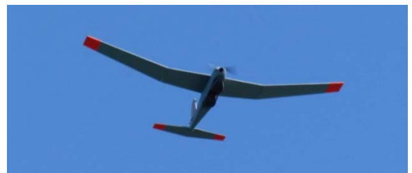
Fixed wing Puma UAS system

Each year, use of Unmanned Aircraft Systems (UAS or 'drones') is increasing, but what are the consequences to wildlife? A pilot (less) project was conducted on closed Refuge islands along the outer coast of Washington to assess the level of disturbance to seabirds and marine mammals. Additional objectives included assessing (Continued on next page)