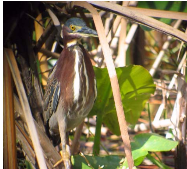
Green Heron