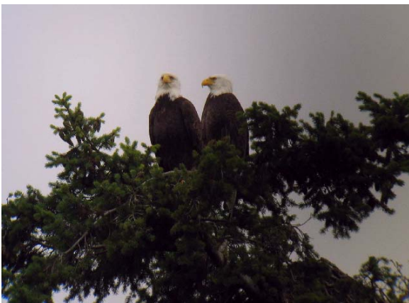
Bald Eagles