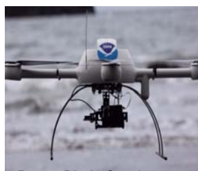
Rotary Blade Quadracopter

She transferred to the Washington Maritime NWRC in 2009 where she conducts annual seabird colony counts within the Washington Islands NWRs; midwinter waterfowl and shorebird surveys on Dungeness NWR; and research and monitoring of seabirds on Protection Island and San Juan Islands NWRs.