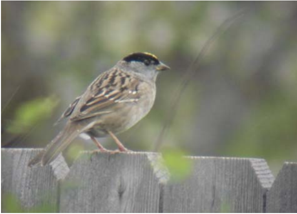
Golden-crowned Sparrow