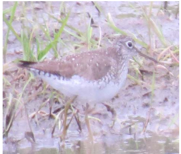
Solitary Sandpiper