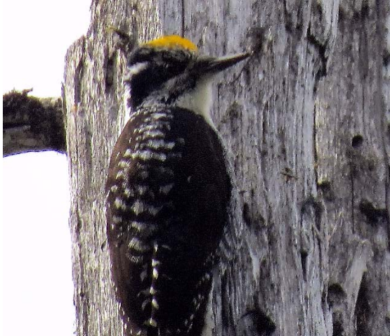
Three-toed Woodpecker