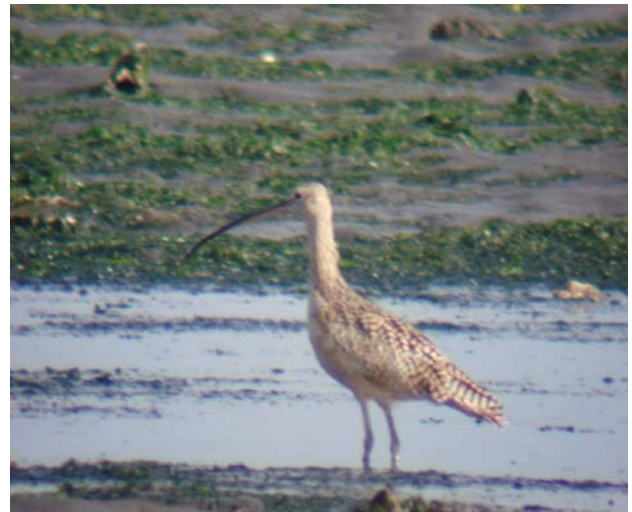
Long-billed Curlew