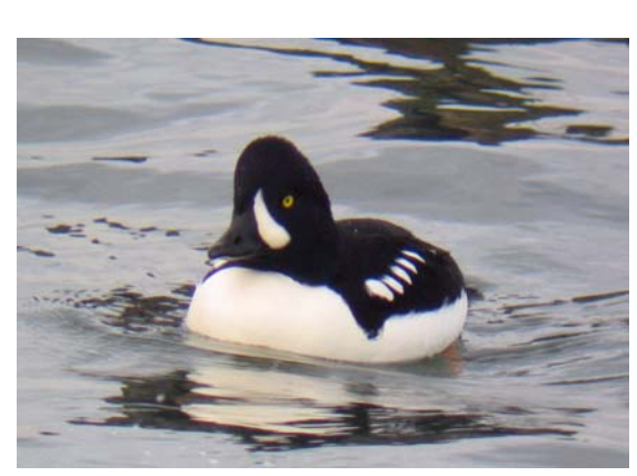
Barrow's Goldeneve