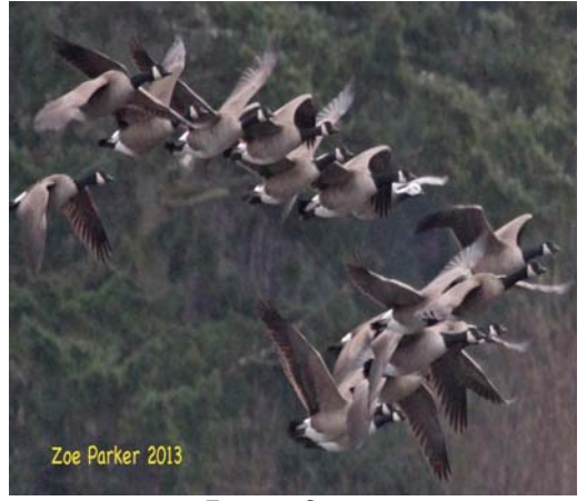
Emperor Goose

Tree Sparrow down near the hay barn on Schmuck road. No. 297. With five weeks to go and possible birds simply dwindling to nothing, off-the-wall records were searched. And one was found. Back on Oct 5<sup>th</sup> out at 2<sup>nd</sup> Beach, La Push, a record turned up of a Mottled Petrel discovered on a COASST survey by Sue Keilman and Scott Horton - with photos! A dead bird! That's what COASST is about: surveying shorelines for dead birds. Can we count a dead bird? Yup! It's an accepted facet of the record-game. No. 298. This piece of data was found the last day of November. A month to go. Now what? There was a possible bird that hadn't yet been verified; a bird that should've been seen months ago but wasn't. Short-tailed Shearwater. And now was prime time for it off the outer coast. But cold weather had hit us. Temperatures were in the teens. And nasty wind. Not a time to be out on the coast. But a days-long trip was made to Neah Bay, where after many hours freezing and scoping from the platform at Cape Flattery this shearwater was found in company of Sooty Shearwaters; and identified. No. 299. But the bird-well seemed truly empty.