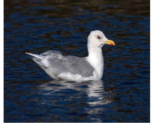
Kumlien's Iceland Gull

The code 4s have also put in a good appearance. On Sept 6, a Franklin's Gull was found west of 3 Crabs amongst the hundreds of California gulls. Flushed repeatedly by eagles flying overhead, the gull was not relocated, partly due to the dense fog that persisted for several days. Then Palm Warblers showed up. Scott Atkinson found