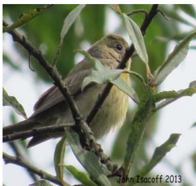
Painted Bunting