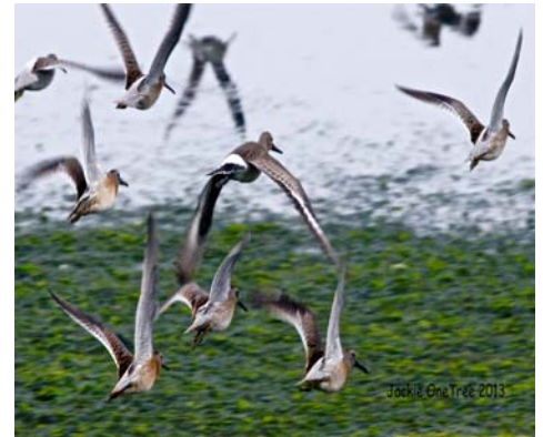
Hudsonian Godwit