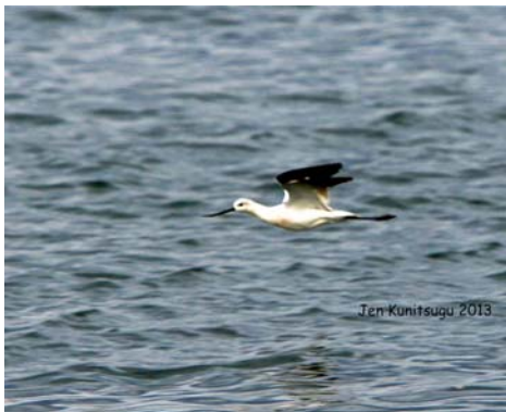
American Avocet

The next feathered wonder was probably the same bird seen over in Jefferson county a week before, and two weeks before that in Kitsap county: an American Avocet! Jen Kunitsugu, visiting our area from across the pond, was at 3 Crabs when she found this basic plumed male standing along the shore just over the rocks at the end of the road. She said it flushed, flew out and landed in amongst American Wigeons. This bird hung in the area for almost a week giving many good looks and opportunities to photograph. But wait, the rush of rarities wasn't even close to being over. Next came a Lark Sparrow followed by a Rock Wren found on the same day [10.06]. Where? Neah Bay again. Who? Ryan Shaw and Dan Waggoner, again. The Lark Sparrow was found along the Tsoo-Yess river road across from Makah beach. The Rock Wren was, quite appropriately, found at the rock quarry behind the sewage treatment plant. The sparrow wasn't