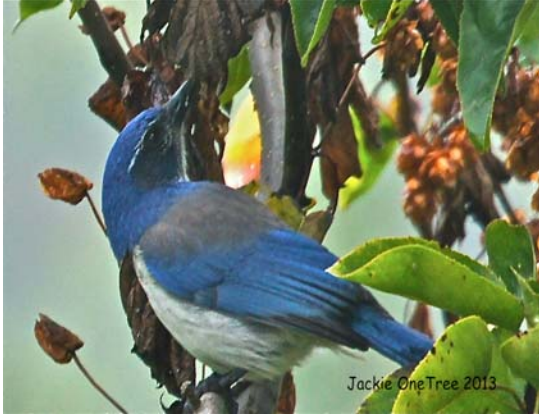
Western Scrub Jay

The code 4s have also put in a good appearance. On Sept 6, a Franklin's Gull was found west of 3 Crabs amongst the hundreds of California gulls. Flushed repeatedly by eagles flying overhead, the gull was not relocated, partly due to the dense fog that persisted for several days. Then Palm Warblers showed up. Scott Atkinson found