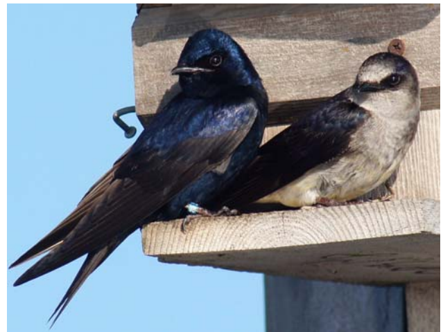
Purple Martin pair nesting in 3 Crabs boxes, Aug. 2013