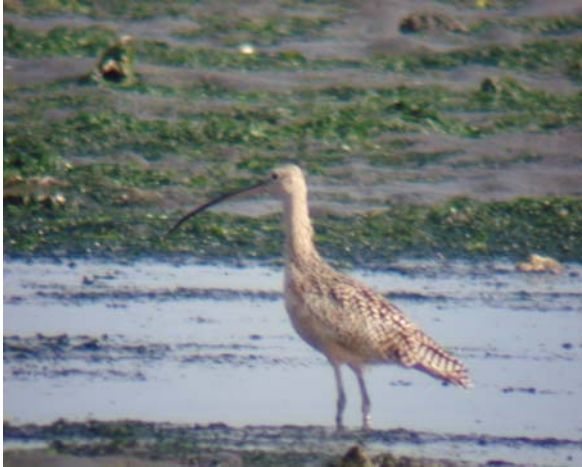
Long-billed Curlew

Cooper's and Sharp-shinned Hawks are making their appearance noted as they work through woods and rural areas for their prey. A female Peale's Peregrine Falcon has been seen on numerous occasions in the Dungeness area working the shorebird flocks. Of the 19 known Red-tailed Hawk nests in the county, at least 28 young were fledged; and of the 14 known Northern Harrier nesting sites in the county, at least 31 young were fledged. The Osprey nest at Neah Bay fledged two young. Two fledgling American Kestrels were being fed by an adult female in the McDonald creek area in late July.