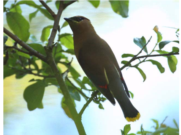
Cedar Waxwing