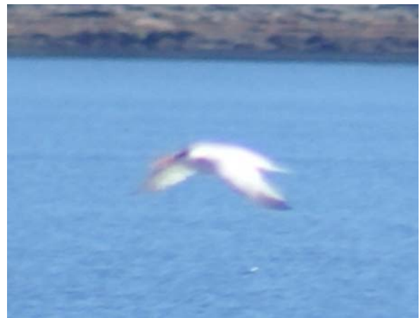
Elegant Tern