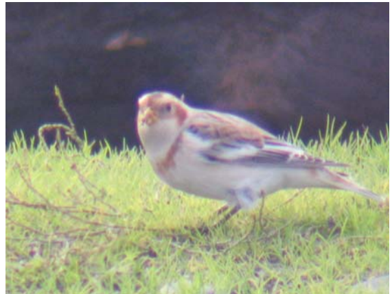
Snow Bunting

Days are lengthening and birds are beginning to sing. Please report your interesting bird sightings to me at bboek@olympus.net or 360-681-4867. Have a birdy 2012!