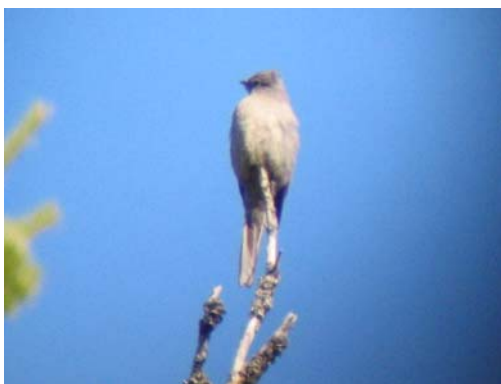
Townsend's Solitaire