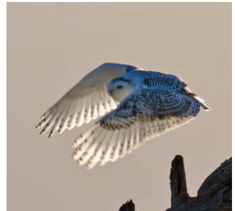
Snowy Owl

Golden-Plover sp. – Seen by Denny with Black-bellied Plovers in Dungeness Bay. It was smaller than the BB Plovers, with smaller bill and no black axillaries, so it fits a golden-plover, but which one? It perhaps fits American Golden-Plover best because it had distinct superciliary line, but, again, Am. Golden-Plovers winter in southern South America and are much less likely than Pacific Golden-Plover.