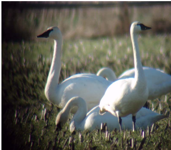
Trumpeter Swans