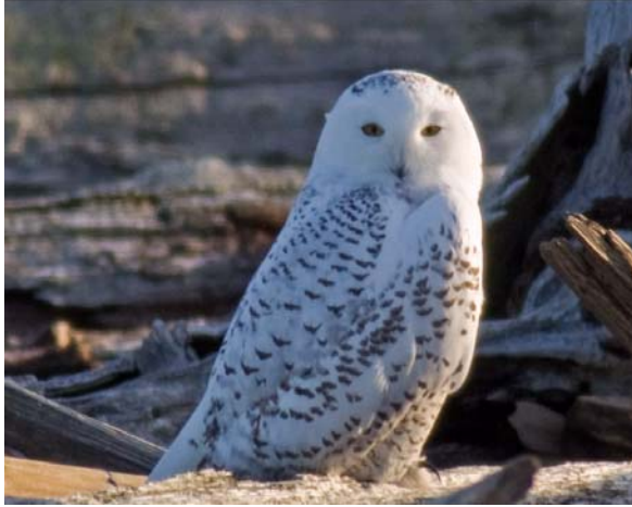
Snowy Owl

They could show up anywhere - on 12/22 one sat on a rooftop in the neighborhood east of the ONP visitor's center, and on 12/29 one sat on a rooftop in Sunland north of Sequim. The most reliable place to see them continues to be Dungeness Spit, although by early January we received reports that people did not see them there. But continue your vigilance and let me know when and where you find these magical birds.