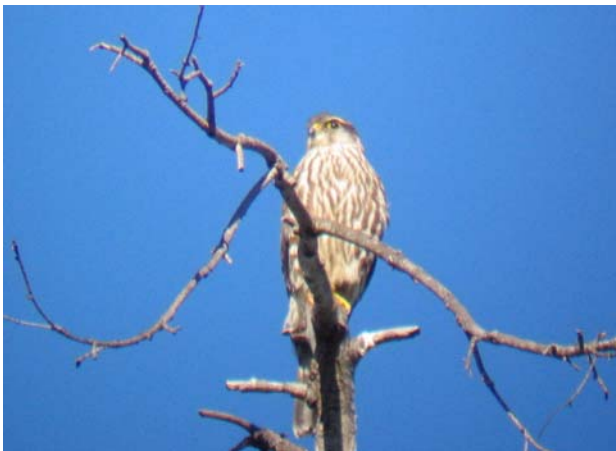
Merlin