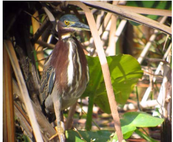
Green Heron