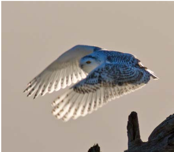
Snowy Owl