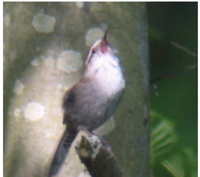
Bewick's Wren

This class is designed for beginning birders, new residents, and anyone who wants to better understand birds in general. These seminars include basic bird identification, bird feeders, birdhouses, field guides, and birding optics. Limit: 16 people.